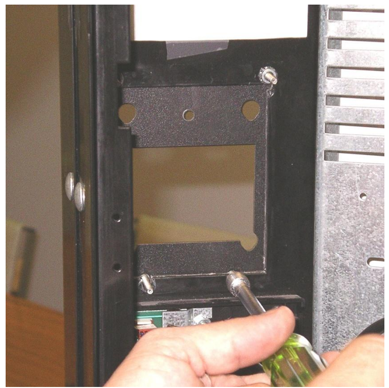
Installing the trim ring nuts (standard shown)

5. Remove the center, locking screw from the Cashless Vending device, leaving the four corner screws tightly in place. From the outside of the door, insert the Cashless Vending device. The four corner screws should go through the four holes in the trim ring and slip slightly downwards. The center, locking screw is then installed from the inside to affix the reader in place.