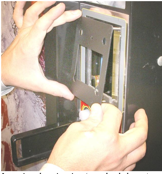
Inserting the trim ring (standard shown)

3. Depending on the design of the vending machine, insert the appropriate trim ring into the empty window. If the window has studs, then the studless mounting plate (MFP-119047) should be used. If the window does NOT have studs of its own, then one of the two trim rings should be used (either MFP-119046 or a combination of MFP-119012 and MFP-119047, depending on fit).