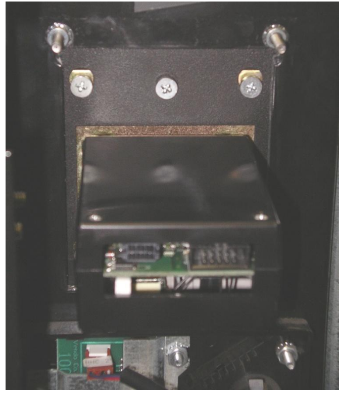
The installed Cashless Vending device (standard shown)