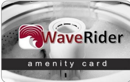
Amenity Card, front and back:

WaveRider Amenity Cards allow you to offer your guests complimentary use of laundry facilities. The Amenity Card gives the guest access to laundry without having to use cash, credit, or debit cards. Use the steps in this how-to document to log into the WaveRider system, select a card, and set up the card for your guest.